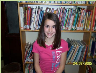
A message from the Editor-In-Chief...